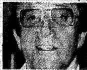
Peter Sellers (BBC 1, 11.30)