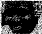
Miriam Makeba (BBC 2)